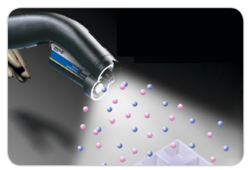
Ionizing Thermoformed Trays