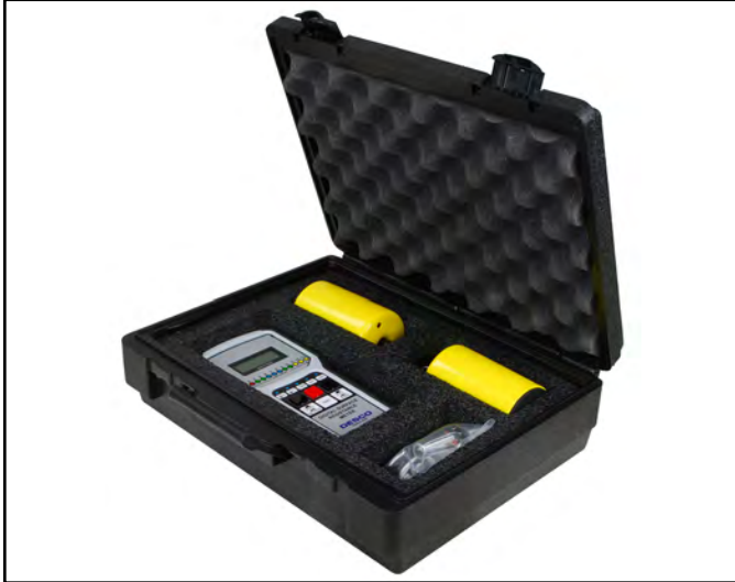
Figure 2. Desco 19787 Digital Surface Resistance Meter Kit