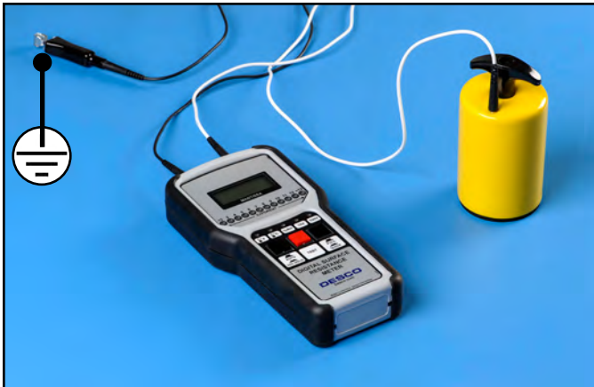
Figure 5. Rtg test setup

If the measurement is outside acceptable limits, clean the surface with an ESD cleaner containing no insulative silicone such as Reztore™ Antistatic Surface & Mat Cleaner , and re-test to determine if the cause of failure is an insulative dirt layer or the ESD worksurface material.