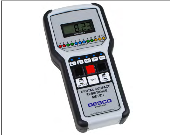
Figure 3. Desco 19788 Digital Surface Resistance Meter