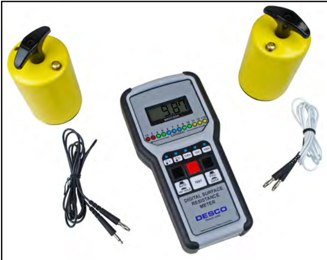
Figure 1. Desco Digital Surface Resistance Meter Kit