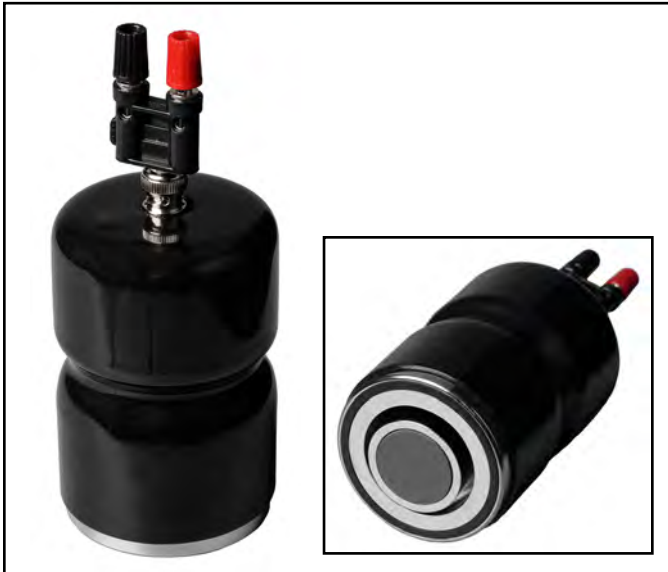
Figure 7. Desco 50005 Concentric Ring Probe

The Desco 50005 Concentric Ring Probe is an instrument to be used in conjunction with a resistance meter, such as the Desco 19787 Digital Surface Resistance Meter, to measure surface resistance per ANSI/ESD STM11.11 the test method listed in Packaging standard ANSI/ESD S541 for surface resistance of planar materials.