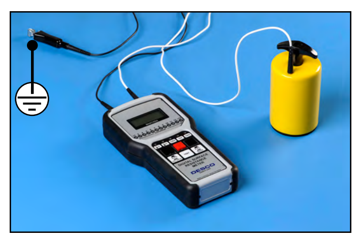
Figure 5. Rtg test setup

If the measurement is outside acceptable limits, clean the surface with an ESD cleaner containing no insulative silicone such as Reztore™ Antistatic Surface & Mat Cleaner, and re-test to determine if the cause of failure is an insulative dirt layer or the ESD worksurface material.