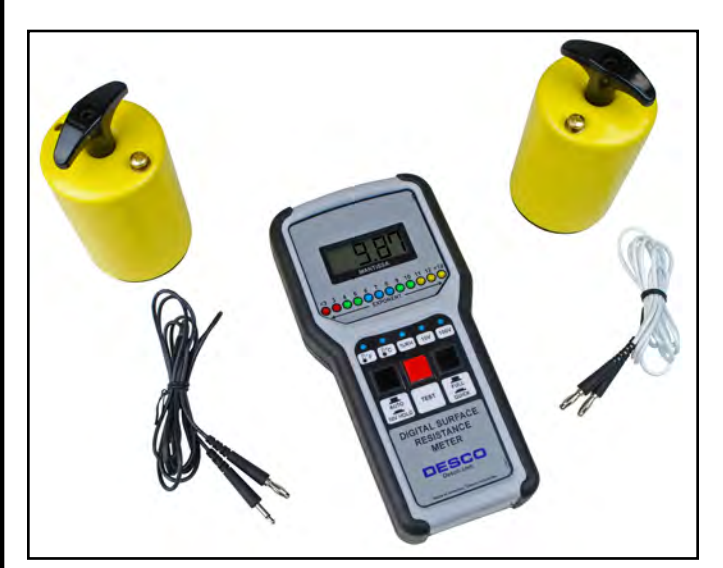
Figure 1. Desco Digital Surface Resistance Meter Kit