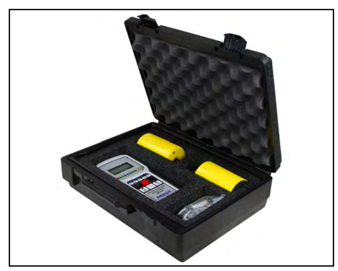
Figure 2. Desco <u>19787</u> Digital Surface Resistance Meter Kit