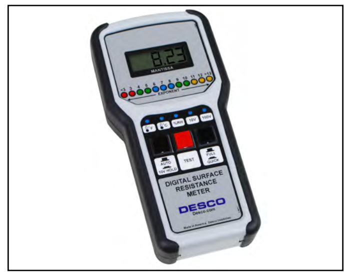
Figure 3. Desco <u>19788</u> Digital Surface Resistance Meter