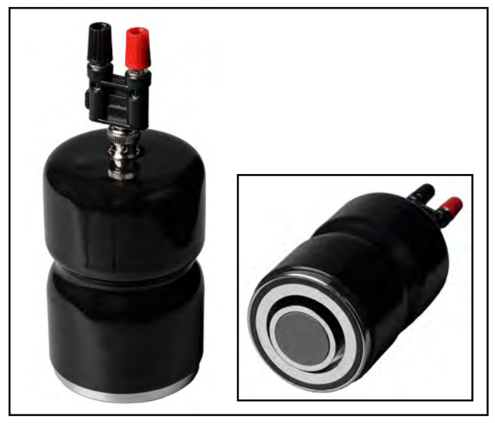
Figure 7. Desco 50005 Concentric Ring Probe

The Desco 50005 Concentric Ring Probe is an instrument to be used in conjunction with a resistance meter, such as the Desco 19787 Digital Surface Resistance Meter, to measure surface resistance per ANSI/ESD STM11.11 the test method listed in Packaging standard ANSI/ESD S541 for surface resistance of planar materials.